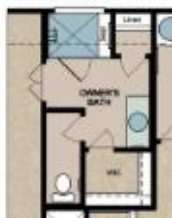
OPTIONAL OWNER'S BATH 4 W/ WATER CLOSET ENCLOSURE