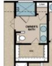
OPTIONAL OWNER'S BATH 3 W/ OPTIONAL DBL VANITY