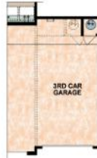
OPTIONAL 3RD CAR GARAGE