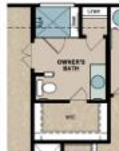
OPTIONAL OWNER'S BATH 4