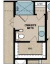
OPTIONAL OWNER'S BATH 3