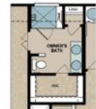
OPTIONAL OWNER'S BATH 4 W/ OPTIONAL DBL VANITY