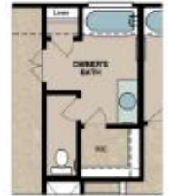
OPTIONAL WATER CLOSET ENCLOSURE