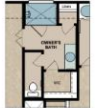
OPTIONAL OWNER'S BATH 3 W/ WATER CLOSET ENCLOSURE