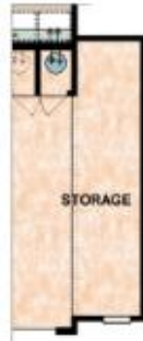
OPTIONAL 5' STORAGE