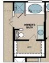
OPTIONAL OWNER'S BATH 1