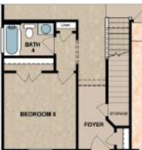
OPTIONAL BEDROOM 5 / BATH 4