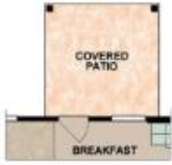
OPTIONAL COVERED PATIO #1