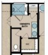
OPTIONAL OWNER'S BATH 4 W/ WATER CLOSET ENCLOSURE W/ OPTIONAL DBL VANITY