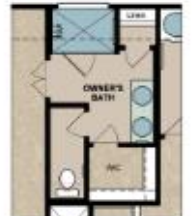
OPTIONAL OWNER'S BATH 3 W/ WATER CLOSET ENCLOSURE W/ OPTIONAL DBL VANITY