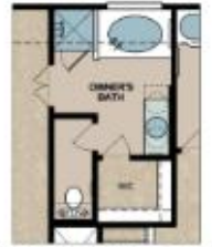
OPTIONAL OWNER'S BATH 1 W/ WATER CLOSET ENCLOSURE